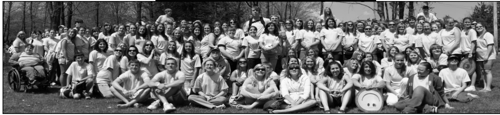
Cambria County Spring Fling

Remembering ADAM's Spring Fling celebrations have grown to include nearly 650 students in both Cambria and Indiana counties. The high schools that participated in Cambria County include Cambria Heights, Northern Cambria, Blacklick Valley, Greater Johnstown, Portage Area, Bishop Carroll and Saltsburg. The weather cooperated giving us a beautiful warm day for our fun-filled activities. There was lots of food, drink, and fun.